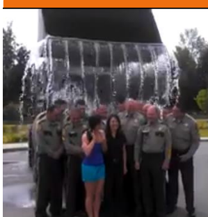
Somerset & Franklin