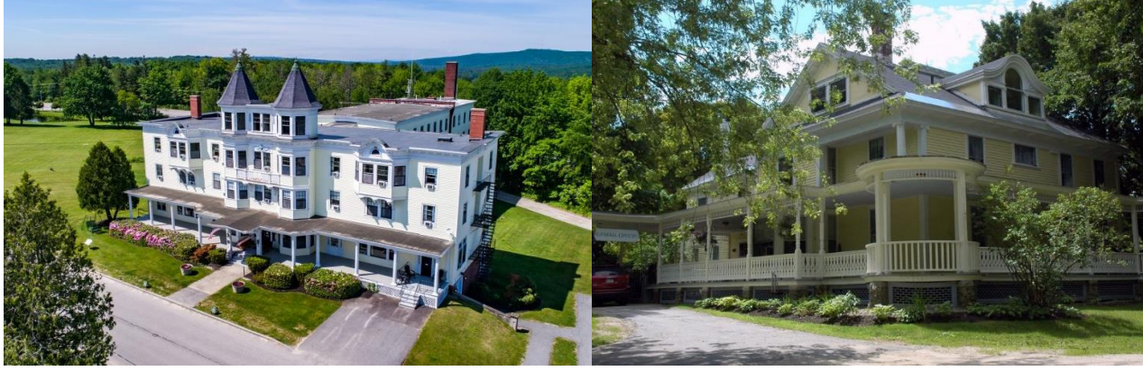
Poland Spring Presidential Inn