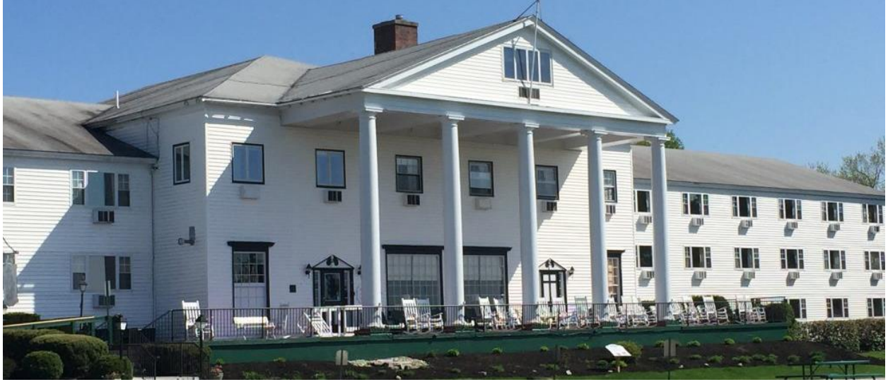
The Maine Inn