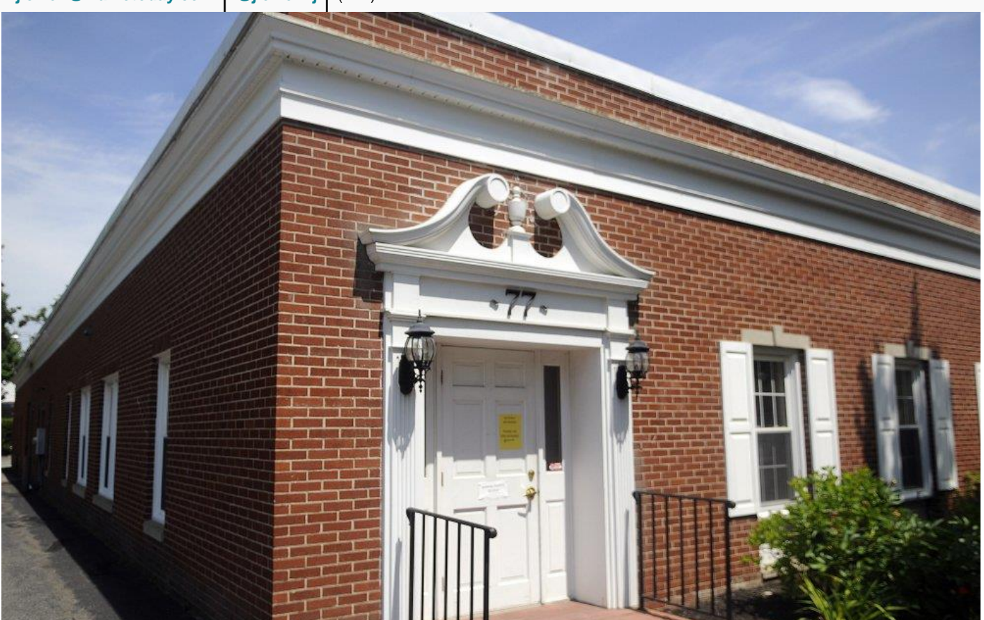
The new site of the Kennebec Country Registry of Deeds at 77 Winthrop St. in Augusta on Monday.