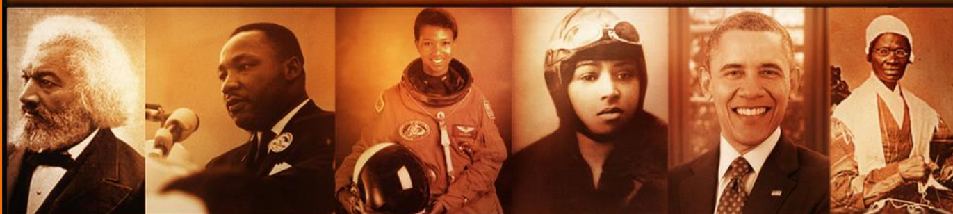
Frederick Douglass Dr. Martin L. King Jr. Dr. Mae Jemison Pilot Bessie Coleman Barack Obama Sojourner Truth

The Kennebec Sheriff's office recently tested brand new communication equipment purchased using money from a grant that was received through Kennebec County Emergency Management. Aqua City gave them tips on how to best use the equipment and helped them with the gear. It will be far more efficient to have direct communications topside and diver to diver in critical rescue or recovery situations. Photos are of the dive team getting several hours of work at the Alford Youth Center in Waterville.